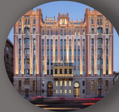
Hungarian Money Museum