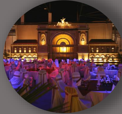
Hungarian Railway Museum