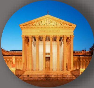
Museum of Fine Arts