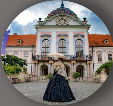
Gödöllő Royal Palace