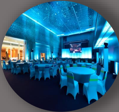
Europa Event Center